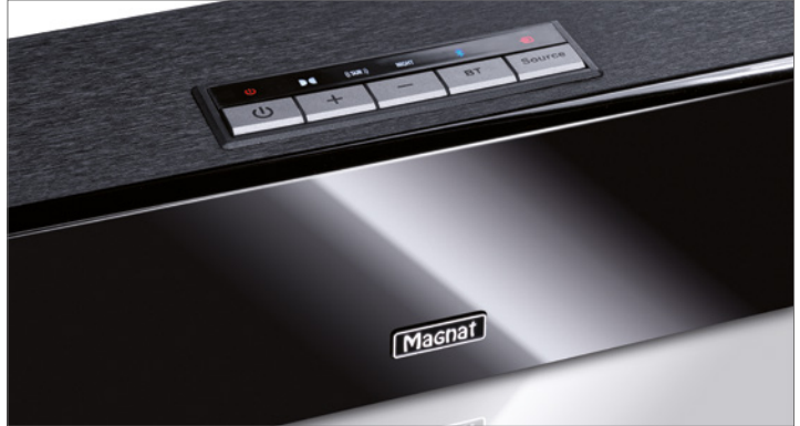
Control panel on the top of the soundbar with LED status indicator and fully controllable via the system remote control

THE POWERFUL LONG-THROW WOOFERS, WHICH MEASURE 200 MM AND 250 MM IN DIAMETER, ARE DIRECTED TO THE SIDE, WHILE THE AERODYNAMICALLY SHAPED BASS REFLEX TUBE ENDS AT THE FRONT.